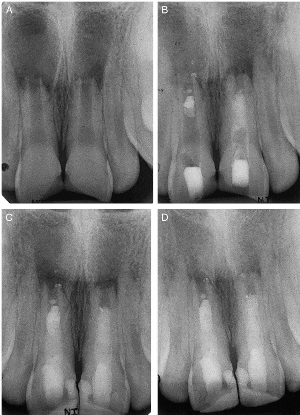
Figure 1. (Case 1) This case highlights the difficulty with induction of bleeding when local anesthetic with vasoconstrictor is used and shows problems with initial placement of MTA. A 13-year-old male presented with fractured incisal edges on teeth 8 and 9. (A) Radiograph showed incompletely formed apices on teeth 8 and 9, and periapical lesion approximately 1 \times 1 cm associated with both teeth. (B) Placement of MTA barrier in teeth 8 and 9 after induction of bleeding. The problem inducing bleeding was overcome by using an anesthetic that did not contain a vasoconstrictor. Barrier placement was farther apical than desired. (C) Completion of composite restorations. Lesions on both teeth at this time appear to be showing signs of healing. (D) A 1-year follow-up showed increased thickness of the apical area on tooth number 9; no apparent changes observed on tooth number 8 and continued healing of lesions. Both teeth 8 and 9 lacked a response to vitality testing at this follow up examination.

CHX. This became the irrigation protocol for all four cases. The saline rinse was used to prevent the interaction between NaOCl and CHX (14). The canals were dried, and a triple antibiotic paste consisting of ciprofloxacin, metronidazole, and minocycline (100 mg of each drug in a 0.5-mL total volume) was placed. The compounding of the antibiotic paste was standardized for all four cases. The teeth were then temporized.